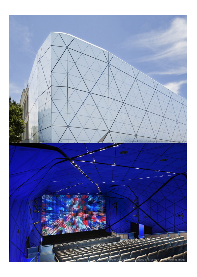
Figure 4. Peter Aaron/Esto. Courtesy of Museum of the Moving Image

the rear addition and added floor have almost doubled the square footage of the galleries and screening facilities. These include a large 267 seat theater, a smaller 68 seat theater and gallery space for the over 14,000 cinematic artifacts from their collection. <sup>15</sup>