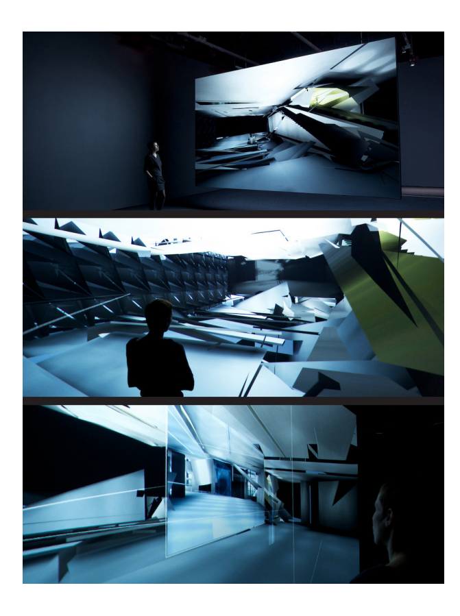
Figure 5.

medium of video is narcissism".<sup>25</sup> The axis of video, directly in and out of the subject in real time enacts a situation in which "consciousness of temporality and of separation between subject and object are simultaneously evacuated."<sup>26</sup> Leeser's Museum of the Moving Image suggests that the tectonics of both video and the digital allow for the infiltration of the cinematic metaphor into the confines of the movie theater itself. Far from the concept of "invisible cinema" across the East River at Anthology, Leeser's cinematic architecture intimates a tessellated surface of potentially endless screens, a kind of pixelated narcissism. Architecture, the rock, disguised as crumpled cinematic paper.