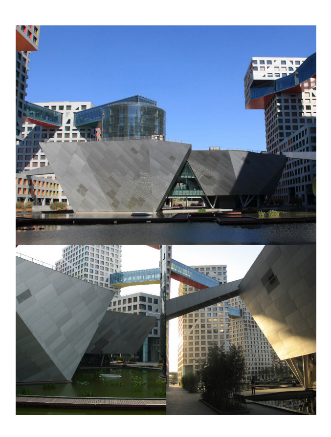
Figure 3. Clockwise: Relan Masato, Theodore Lim of the Sherwood Institute and G. Bugel

Within this context of a scopic regime, Holl's decision to change the window module of the housing towers to a single window per floor, from the previous MIT module of 3 per floor, becomes clear. At MIT the window was part of a regularized geometry